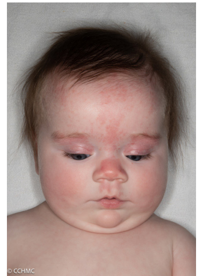
Extensive nevus simplex involving the glabella, upper eyelids, nose and cutaneous upper lip

For urgent issues, or to speak with the specialist on call 24/7, call the Physician Priority Link® at 1-888-987-7997.